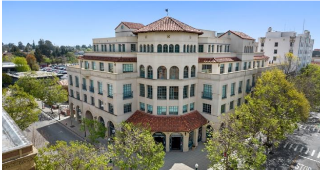
At the new Santa Cruz Medical Offices, members have access to family medicine, lab, mammography, ob-gyn, pediatric, pharmacy, and X-ray services.